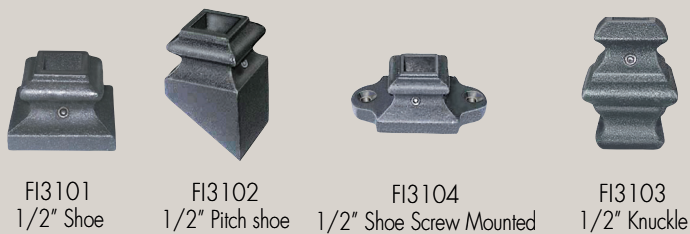
FI3101 1/2" Shoe FI3102 1/2" Pitch shoe FI3104 1/2" Shoe Screw Mounted FI3103 1/2" Knuckle