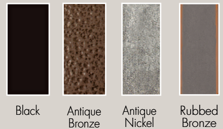
Black Antique Bronze Antique Nickel Rubbed Bronze